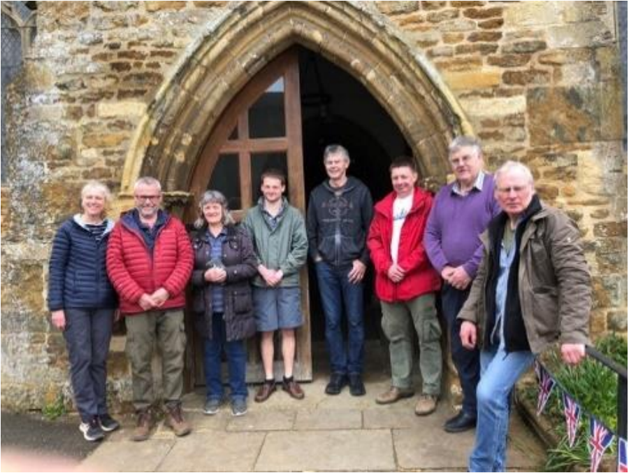
Coronation Peal of Grandsire Triples rung at Hook Norton, see page 19