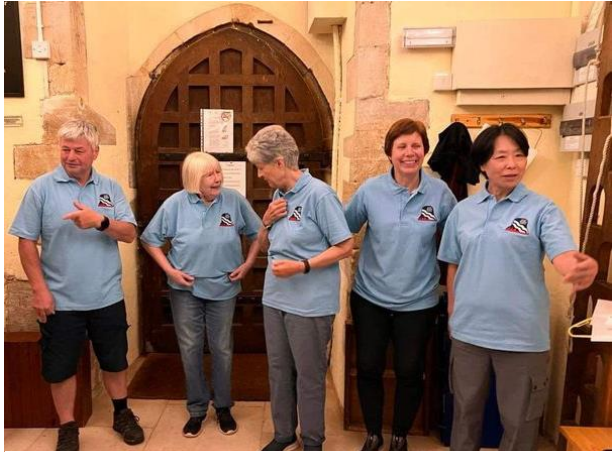
Ringing School teachers and students

who have attended recent ART teaching courses have successfully passed assessment in their module.