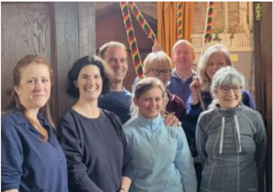
Coombe Tower – Coronation ringers, see page 30