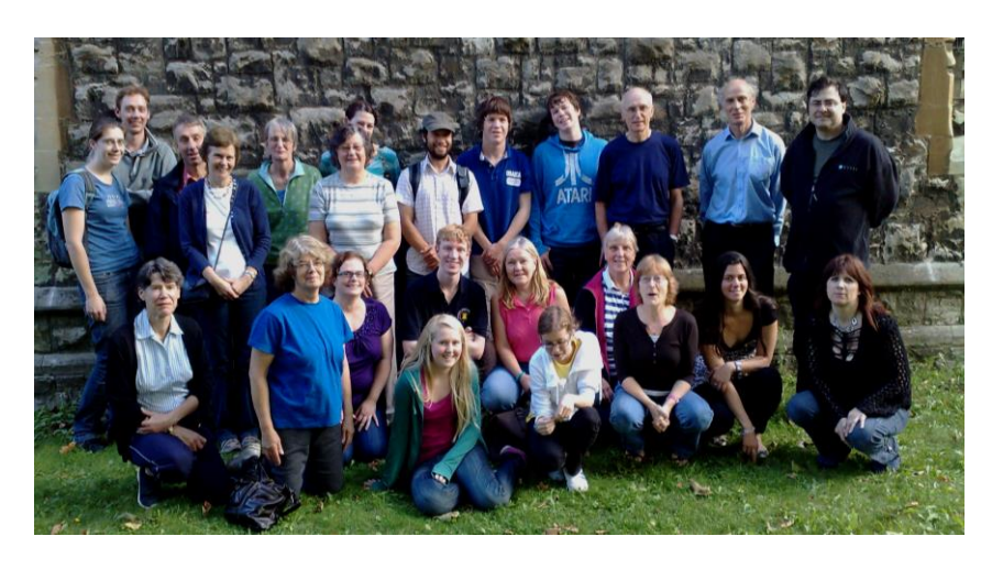
Central Bucks Branch Outing, Saturday 11th September