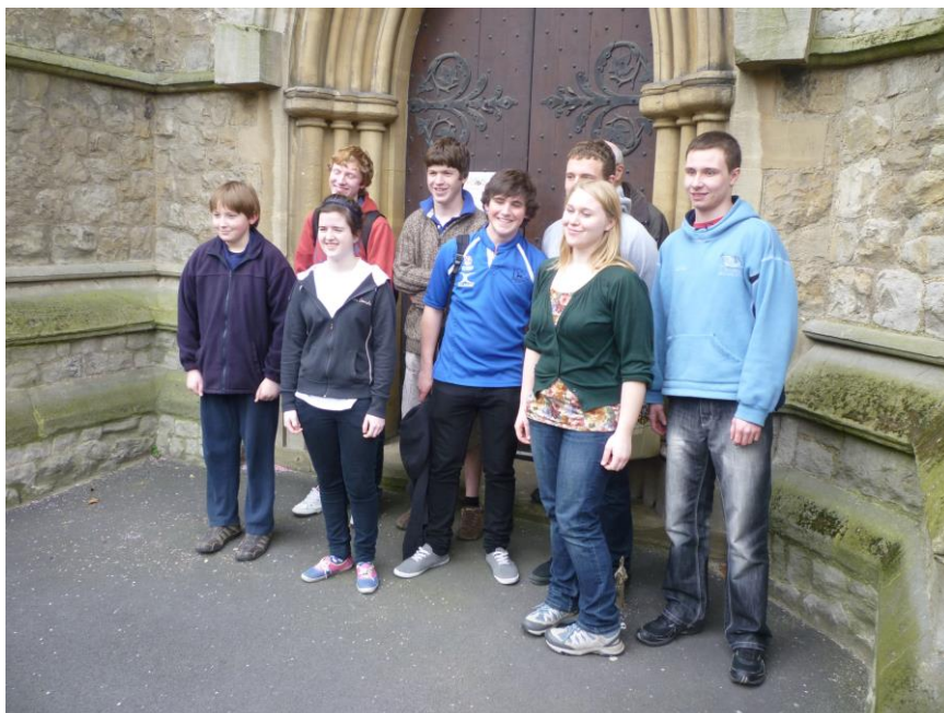
ODG band in the inaugural National Youth Striking Contest