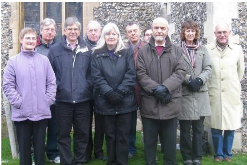
EBSB 10-bell striking competition winners, Nov. 2010