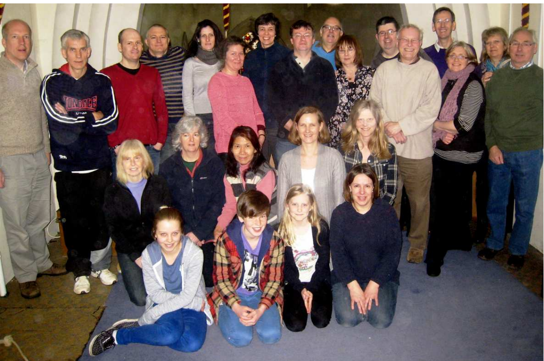
Big Ring Pull ringers and helpers at Wavendon (see page 21)

Newsletter of the Oxford Diocesan Guild of Church Bell Ringers website: odg.org.uk/