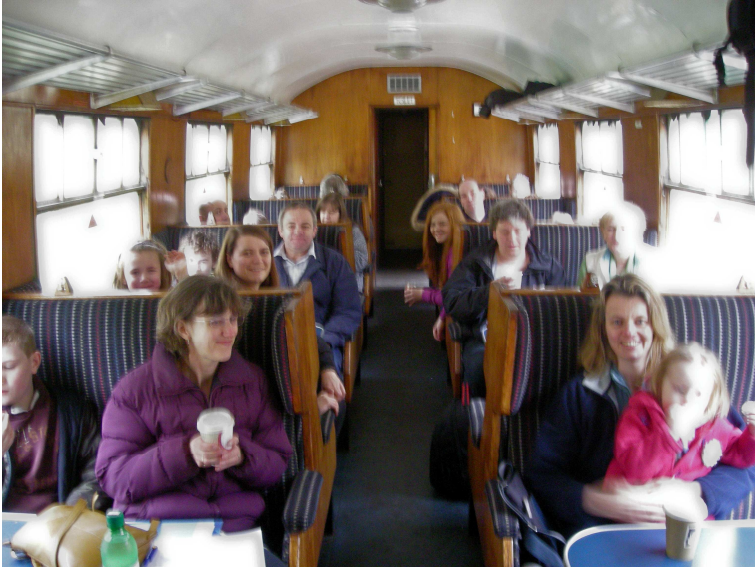
Easthampstead Ringers on the Watercress Line