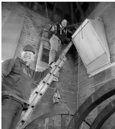
Simon Farrar & Richard Bennett

When I began to ring at Twyford I was concerned by the volume of bells in the immediate vicinity of the church and their likely effect on local residents. On becoming tower captain I decided to tackle the issue. We raised money, investigated possible designs, and went through the lengthy process of gaining permission. We built and installed wooden panels some five inches thick and weighing some 20 kilos each to cover the twelve openings within the tower. Four of the twelve panels have a flap that can be opened to allow sound out and, as each flap can be opened independently, we can adjust the sound levels flexibly on each side of the tower to suit the occasion.