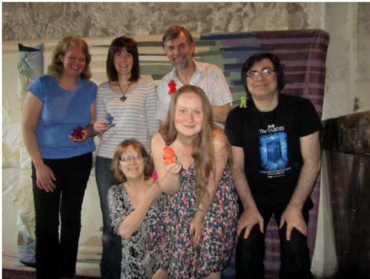
Marsworth Dragon Doubles band holding knitted dragons (see page 13)