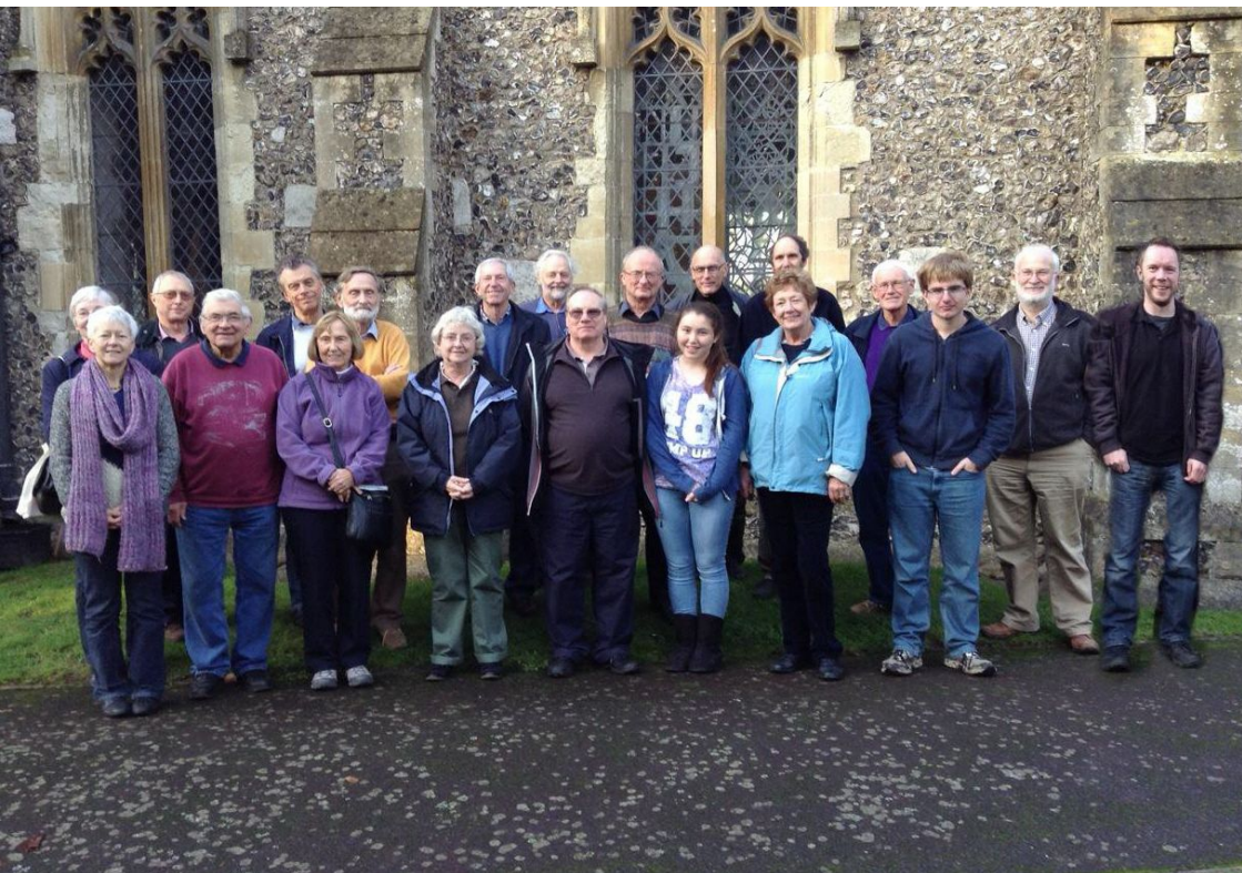
10-bell Training Day at Aston Clinton, see page 6

Newsletter of the Oxford Diocesan Guild of Church Bell Ringers website: odg.org.uk/