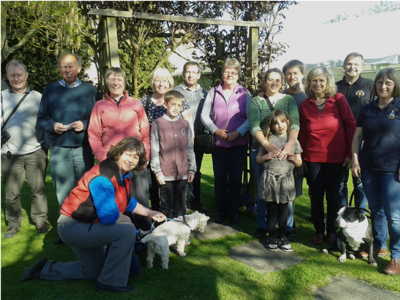
The Bicester branch outing, 18 April 2015, see page 12