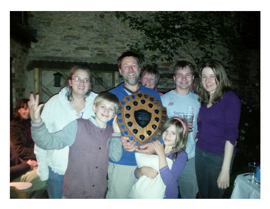
Winners of the 2015 Clifford East Trophy, Bicester Branch striking competition