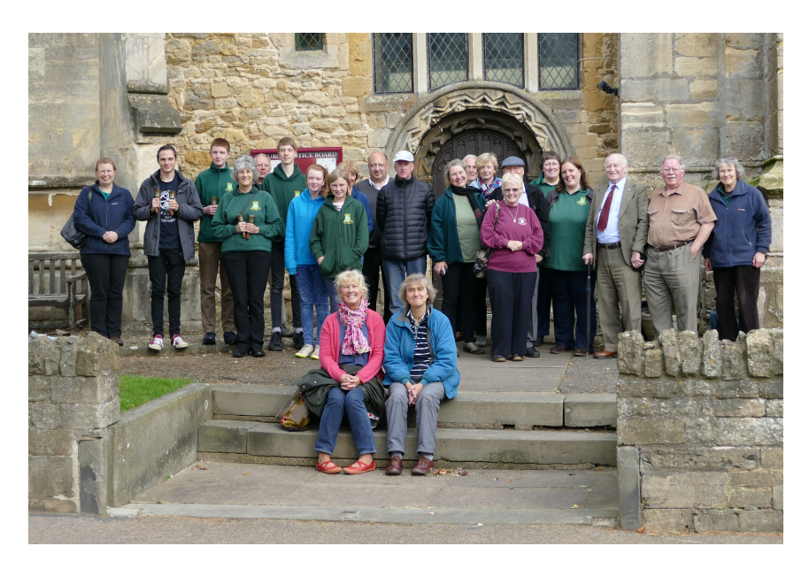
The Witney and Woodstock branch outing to Pershore