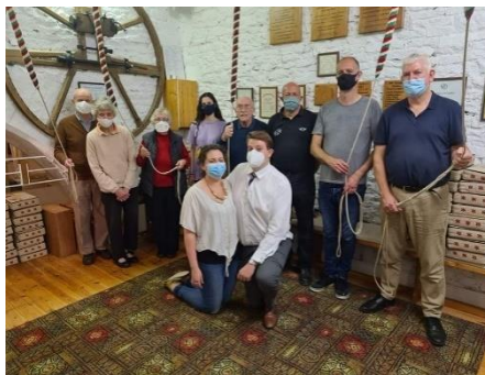
Masked ringers at St Mary's, Chalgrove

The majority of our towers are reporting a shortage of ringers which has led to various recruitment drives. Aston Rowant held a “Tower Tours and Cream Tea Afternoon” in August – and were almost overwhelmed with visitors. Sadly no new recruits were forthcoming. Dorchester’s positive approach throughout lockdown, using a combination of handbells and ringingroom.com has paid dividends – they have managed to recruit and retain two ringers who are keen to transfer all the theory gained to actually ringing the bells.