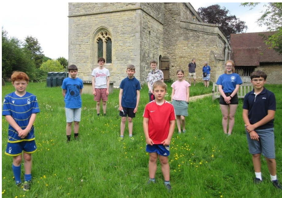
Young Ringers' Half Term outing, [see page 5]