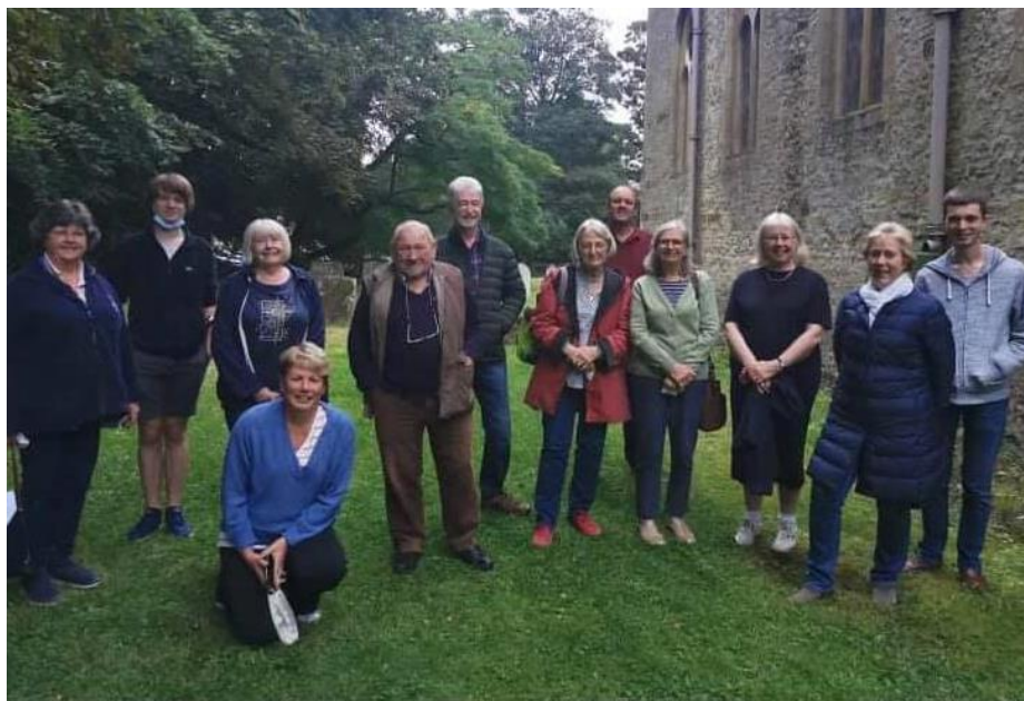
September's BP at Weston-on-the-Green