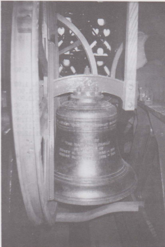
THE NEW TREBLE BELL AT LONG CRENDON