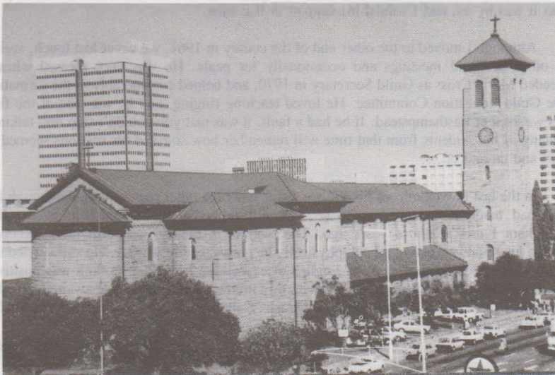
The Cathedral of St. Mary and All Saints, Harare, Zimbabwe.