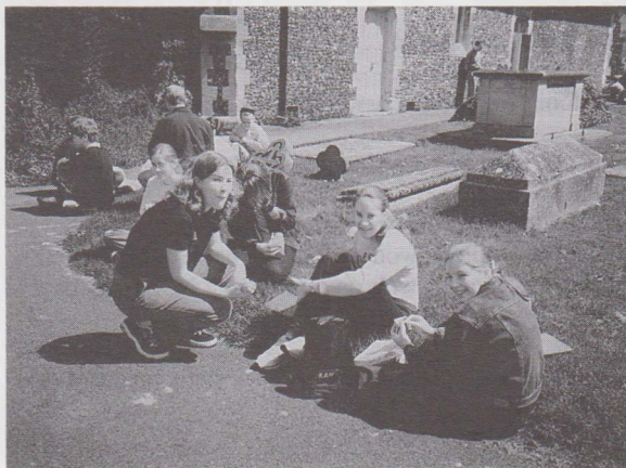
Lunch in Bray Churchyard. Girls from Barkham and Tilehurst in the front; the Shiplake contingent behind

We are grateful for all helpers and tutors who give up the day to help with Guild courses. Progress made, particularly by these young students, proves how beneficial these courses can be.