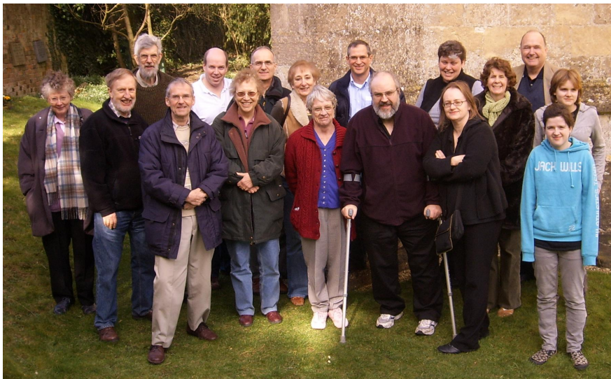
Sonning Deanery branch ringing outing, 1 st March 2008