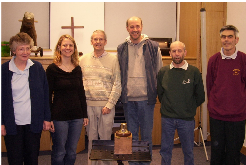
St. Andrew's, Sonning, branch 6-bell striking competition winners