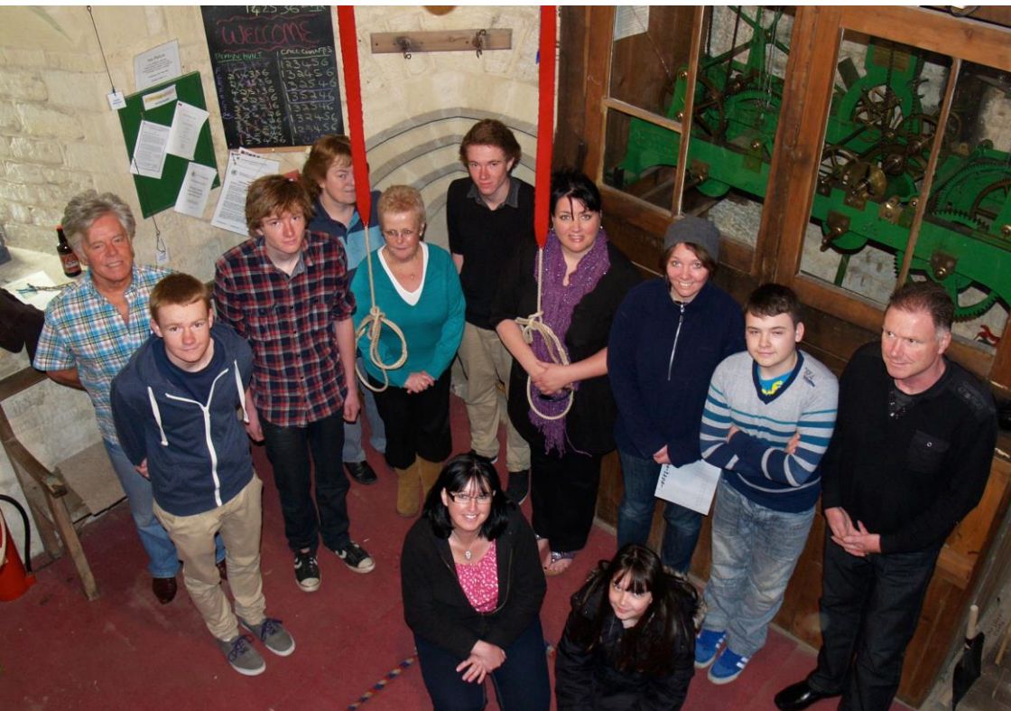
The Leaffield ringers mark the Centenary of the Titanic disaster ( see page 17 )

Newsletter of the Oxford Diocesan Guild of Church Bell Ringers website: odg.org.uk/