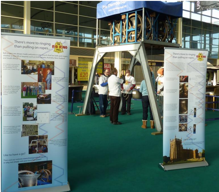
Charnborough ring used at The Big Ring Pull