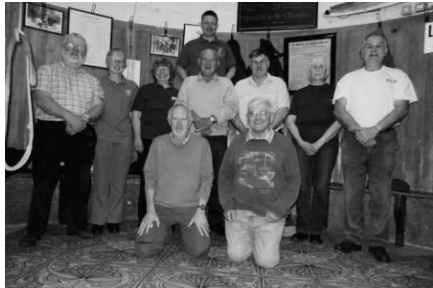
The Banbury band