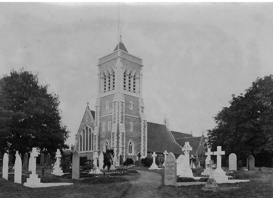
St. Mary's, Twyford, Berkshire in 1913 (see page 5)

Newsletter of the Oxford Diocesan Guild of Church Bell Ringers website: odg.org.uk/