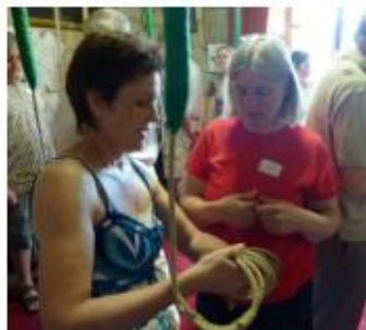
Working in pairs on an ART course