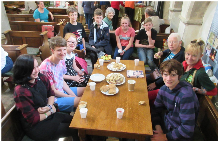
ONB's Young Ringers Outing to St Giles, Oxford – tea