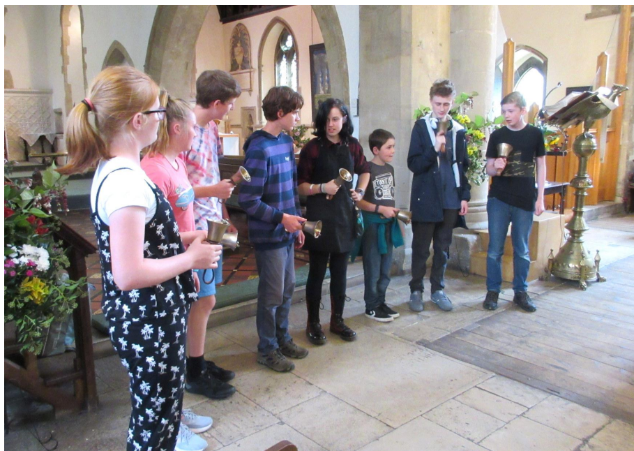
ONB's Young Ringers Outing – 'walking' handbells