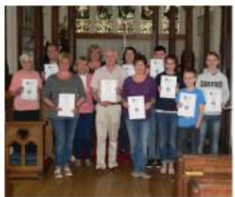
The Maids Moreton band with their LiR Level 1 certificates & teacher accreditations